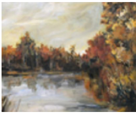
Alan Lin Acrylic Landscapes