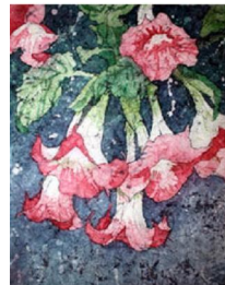
Bonnie Jones Batik Kit Workshop