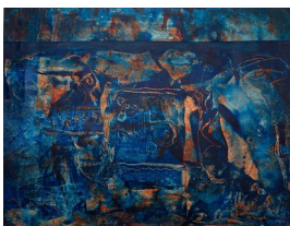
Marylee Voegele Experimental Explorations